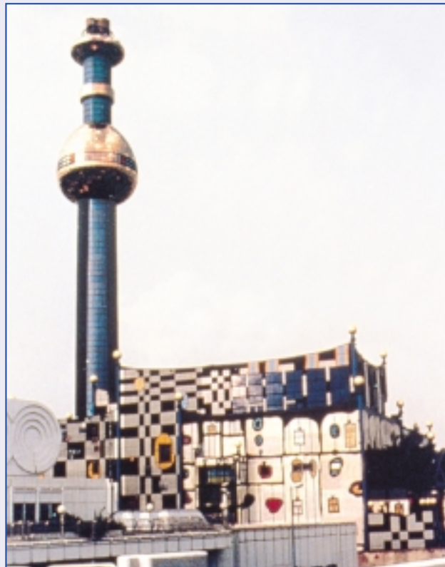
Municipal Solid Waste Incinerator

The definition of "producer responsibilities" with the objective of "resource optimisation" has lately come to the fore in the overall debate involving environmental policy-makers. The recovery of rigid polyurethane foam from demolition waste is one process which illustrates where resource optimisation can be improved, notably by the incineration (leading to energy recovery) of used rigid polyurethanes at the end of their service lives as compared with the usual practice of burying rigid foams in landfill.