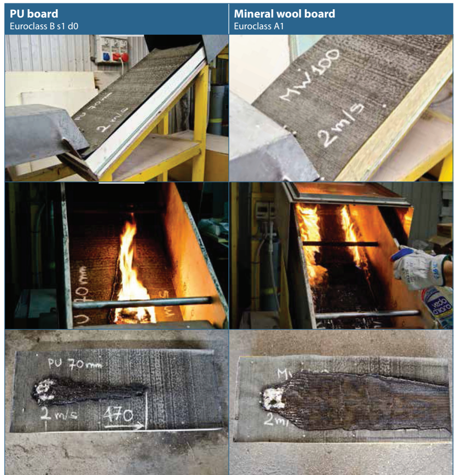
Top: PU board Bottom: MW board

"The PU build-up passed both phases of the test [...]".