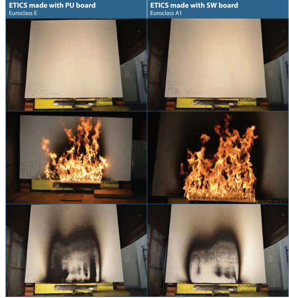
Photos taken before, during and after the tests on two samples of the cladding systems

"[...], both the PU and the stone wool ETICS build-ups maintained their structural integrity and passed the test".